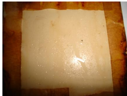
40 % Replacement