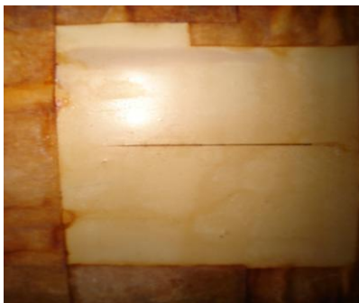
30 % Replacement