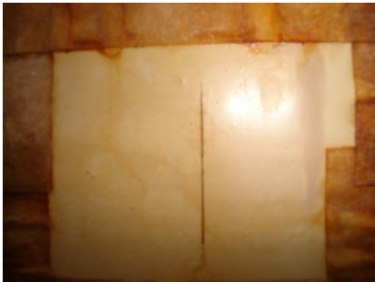
10 % Replacement