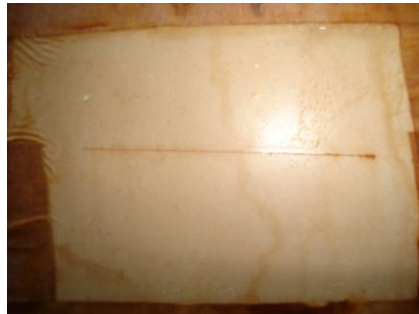
20 % Replacement