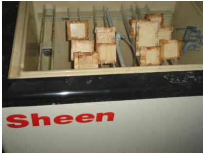
Salt Spray Cabinet